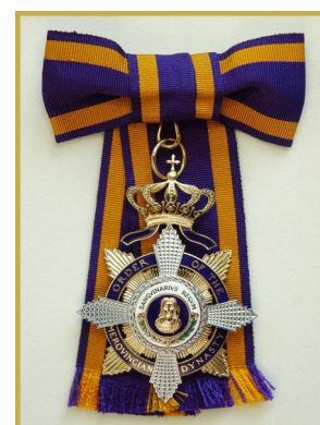
Bow and Tails for Ladies.