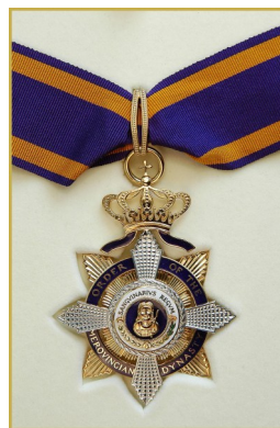
Large Neck Medallion for Gentlemen